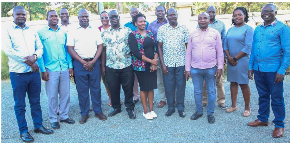
CHMT members and Lwala Community officers after the surveillance exercise.