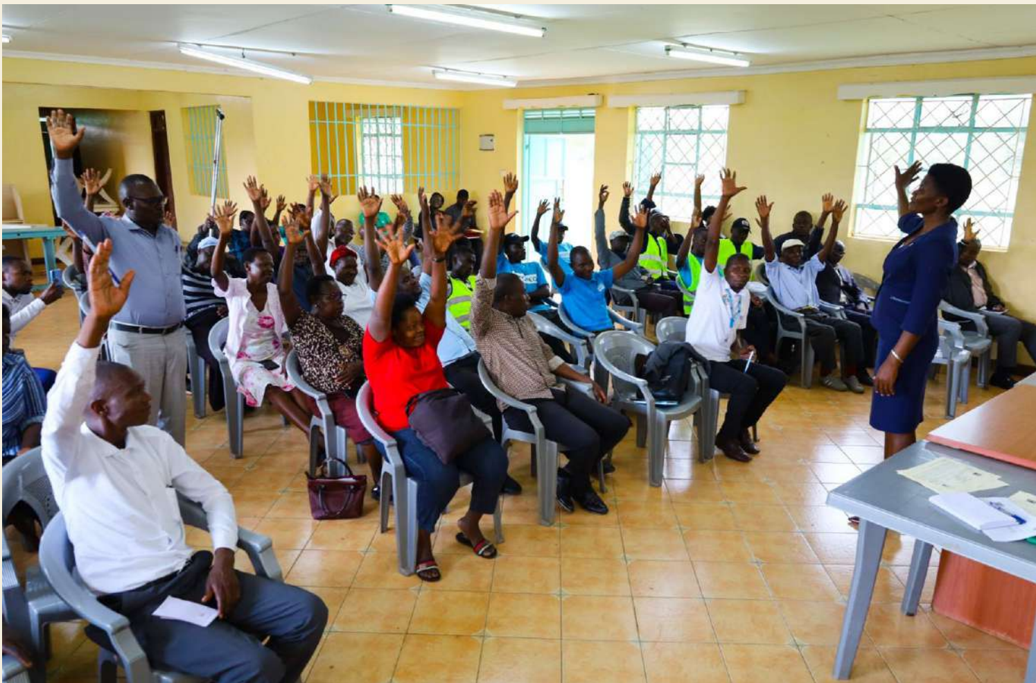
Ndhiwa Residents in an acclamation endorse the setting up of a Hope Center in the area.