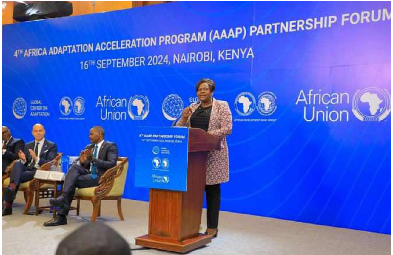
Governor Gladys Wanga addressing the 4th AAAP Forum in Nairobi.

In the bustling city of Nairobi, Governor Gladys Wanga spent most of September navigating high-profile meetings and forums, driven by one goal: to transform her home county of Homa Bay into a beacon of investment and development. As the leader of the only county in Western Kenya hosting a Special Economic Zone (SEZ), she is acutely aware of Homa Bay's potential to become a top-tier destination for investors and tourists alike—and she's on a mission to ensure the county capitalizes on every opportunity.