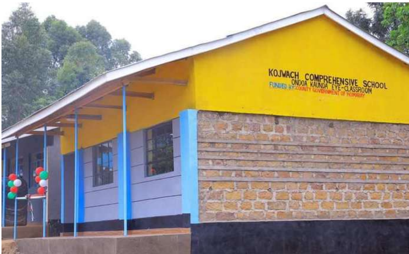
The exterior of Kojwach Primary Ondoa Kaunda Classroom.