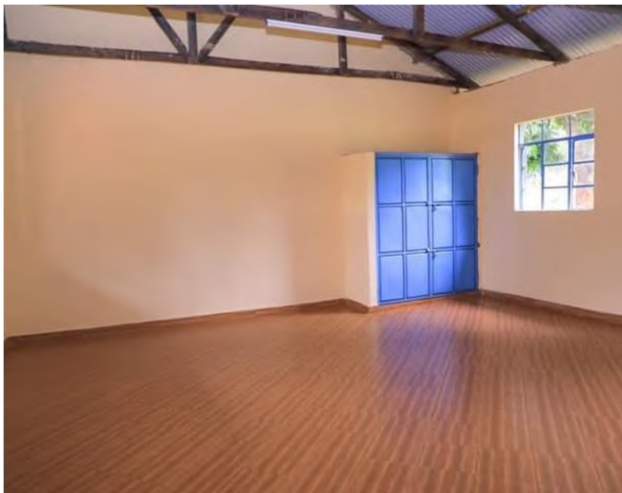
The interior of one of the Ondoa Kaunda Classrooms.

By prioritizing early childhood education through the Ondoa Kaunda project, Homa Bay County is investing in its future generation. The long-term impact will not only be felt in the education sector but will also resonate across the socio-economic fabric of the county, creating a more educated, skilled, and empowered populace. The project stands as a model of how focused government initiatives can drive positive change at the grassroots level.