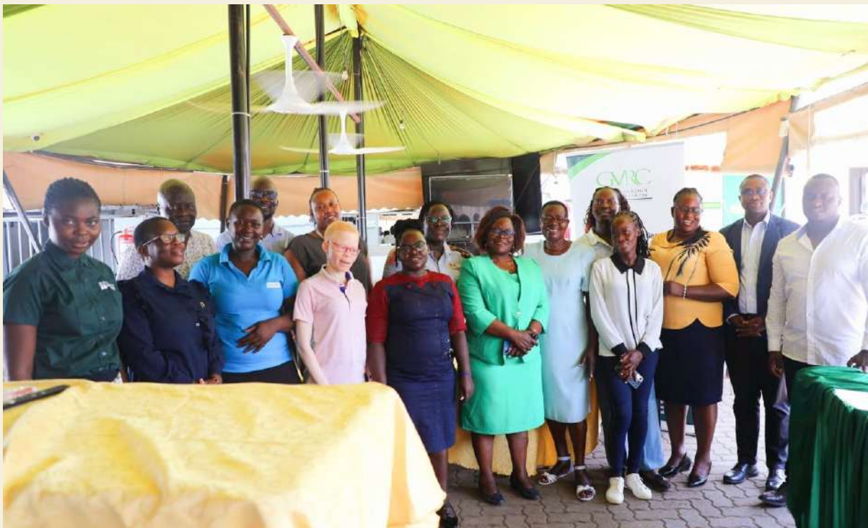
Accelerate Project Officers and Gender Department pose for a group photo after the training.

The meeting comprised of staff from the Department of Gender and Social Services, National Government Administrative Officers, National Police Service, Community Based Organizations and Non-governmental Organizations.