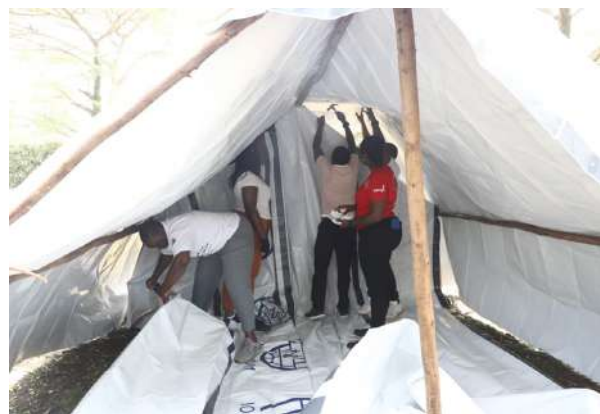
Participants take part in construction of a rescue camp.

The training covered various critical areas, including risk assessment, emergency planning,