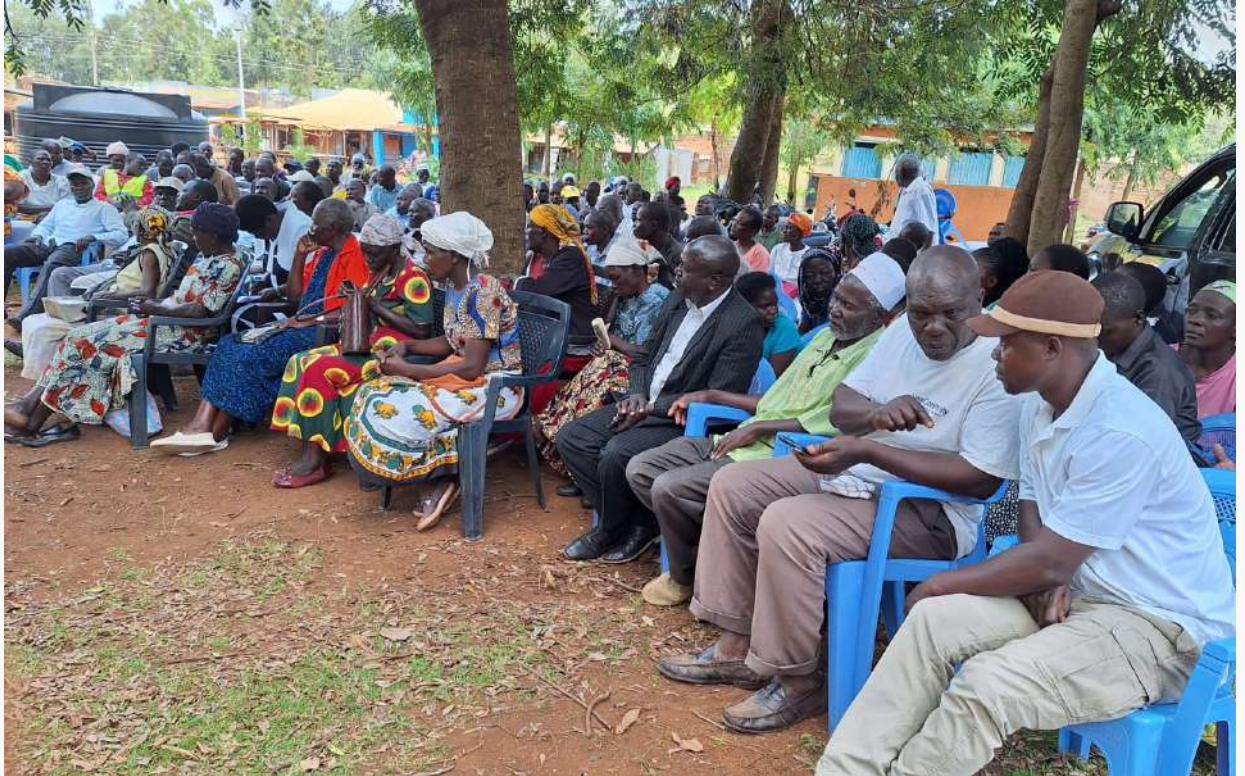
Residents participate on priority projects.