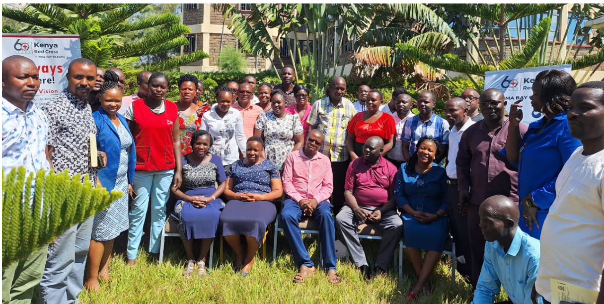
A section of the Administrators who underwent the training.