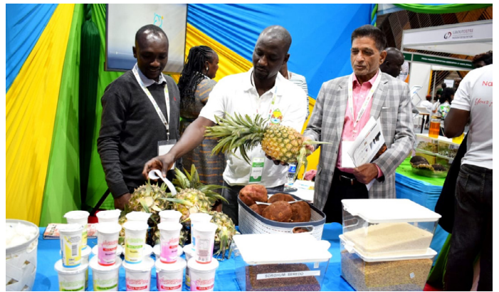
The Homa Bay County booth at the AAE in Nairobi.

Moving forward, Homa Bay aims to build on the connections made at the expo, strengthening partnerships that will drive agribusiness development, expand market linkages, and promote sustainable agricultural practices. With continued investment in research, mechanization, and cooperative movements, the county is well on its way to transforming its agricultural sector into a powerful engine of economic growth and food security.