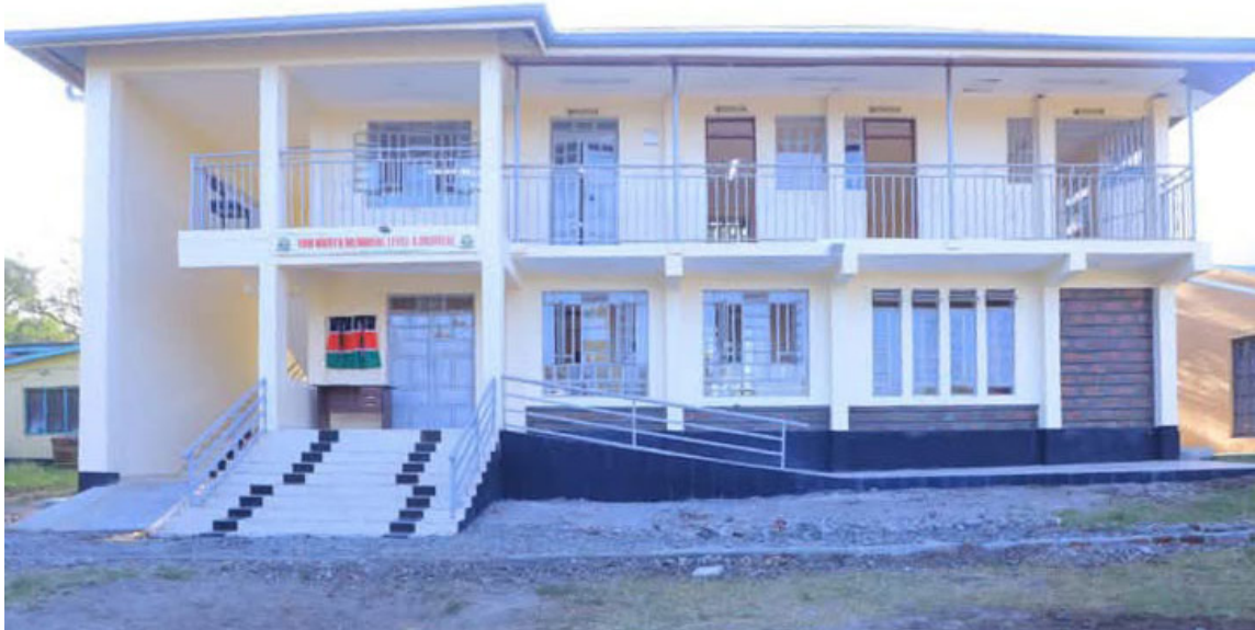
The new Specialists' Center at Tom Mboya Memorial Level IV Hospital.