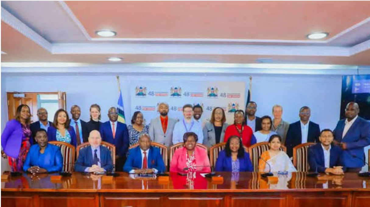
A group photo of the National Steering Committee on Devolution Conference and Development Partners at the CoG Headquarters when it was announced Homa Bay County would host this year's event.

Event tourism (sports, culture, conferencing, music) has been a high-growth tourism segment in recent years and a highly important economic value creator to established towns and cities. Homa Bay County is emerging as a vibrant player in the realm of event tourism, positioning itself as a new frontier in Kenya's enriching landscape.