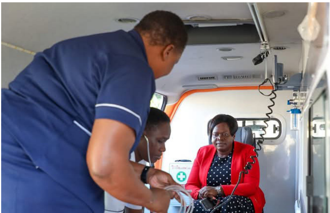
Governor Gladys Wanga observing a demo on referral and evacuation when she unveiled the first County's fully equipped ambulance in 2023.

As Homa Bay continues to strengthen its healthcare services, the message is clear - every second counts in an emergency. When health workers respond promptly and effectively, lives are saved.