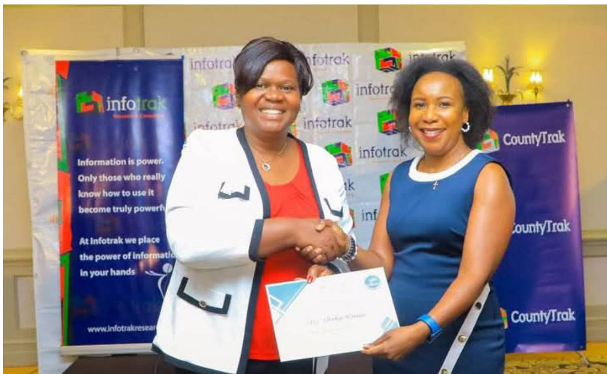
Governor Gladys Wanga receiving a certificate of excellence from Infotrak Research and Consulting CEO Stella Ambitho.

According to Infotrak, “Our current index was conducted between October and December 2024, covering all 47 counties, 290 constituencies, and 1,450 wards, with an overall sample of 36,200. Each county was treated as an individual universe and assigned a cluster sample ranging from 600 to 2,000 respondents, guided by the population and number of wards in each respective county. Sampling frames were designed using population proportionate to size based on census data and took demographics such as age and gender into account. Data was collected through Computer Assisted Telephone