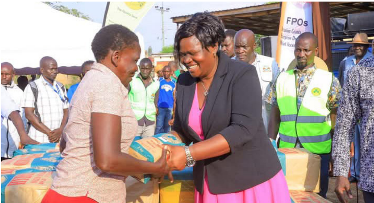
Governor Wanga giving packets of certified seeds to a woman farmer from North Karachuonyo.