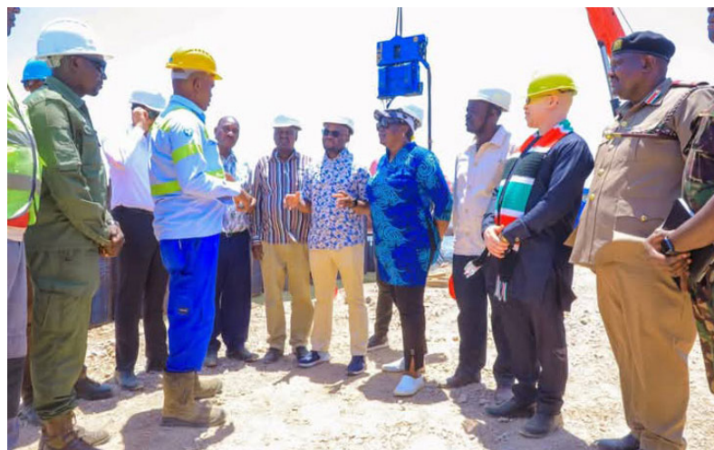
Governor Gladys Wanga and the visiting National Celebrations Steering Committee members led by PS Raymond Omollo getting briefed on the preparations for Madaraka Day Celebrations.

Victoria, presenting the lake as a vital source of livelihood and an enchanting ambience for visitors.