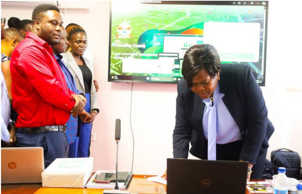
Governor Gladys Wanga logging in to the LIMS public portal.