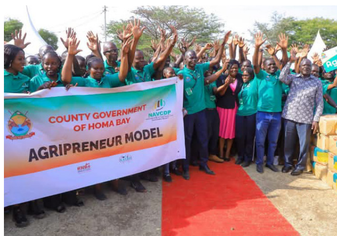
Unveiling of the 250 agripreneurs by Governor Gladys Wanga.

"I encourage our farmers to fully utilize the seeds provided and adopt best agricultural practices. Collaborate closely with our extension officers and agripreneurs to enhance productivity and maximize your returns," she urged.