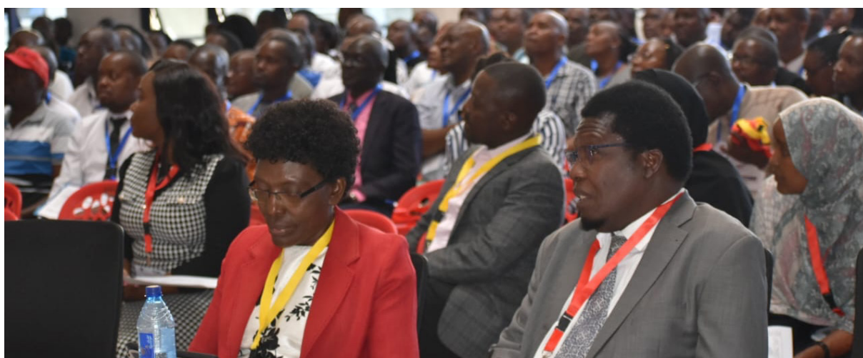
A section of the participants.

The stakeholders resolved their commitment to follow up on the action plans developed during the workshop to ensure that strategies are effectively implemented to promote Gender equity in education across the county.