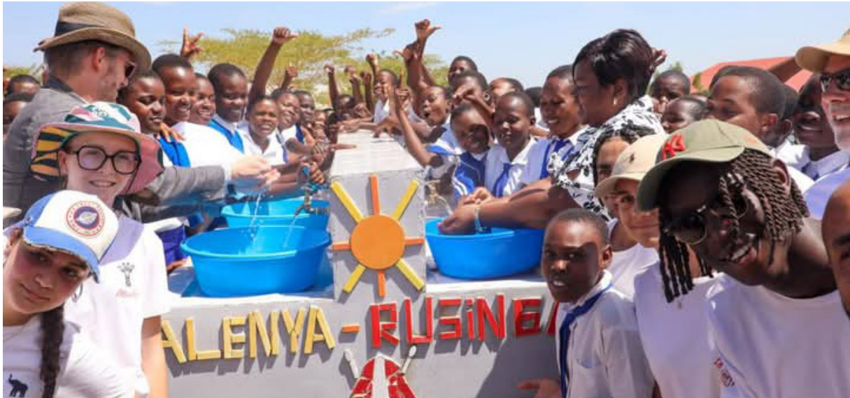
Kaswanga Girls High School students mob Governor Gladys Wanga and French Ambassador to Kenya Arnaud Suquet as the duo opened the taps at the school.

Rusinga Island has recently made significant strides in addressing its longstanding water problems, thanks to the proactive efforts of the Homa Bay County Government led by Governor Gladys Wanga. The latest milestone in this initiative is the commissioning of the Kaswanga Water Project, which adds to a series of successful projects aimed at enhancing water accessibility across the island.