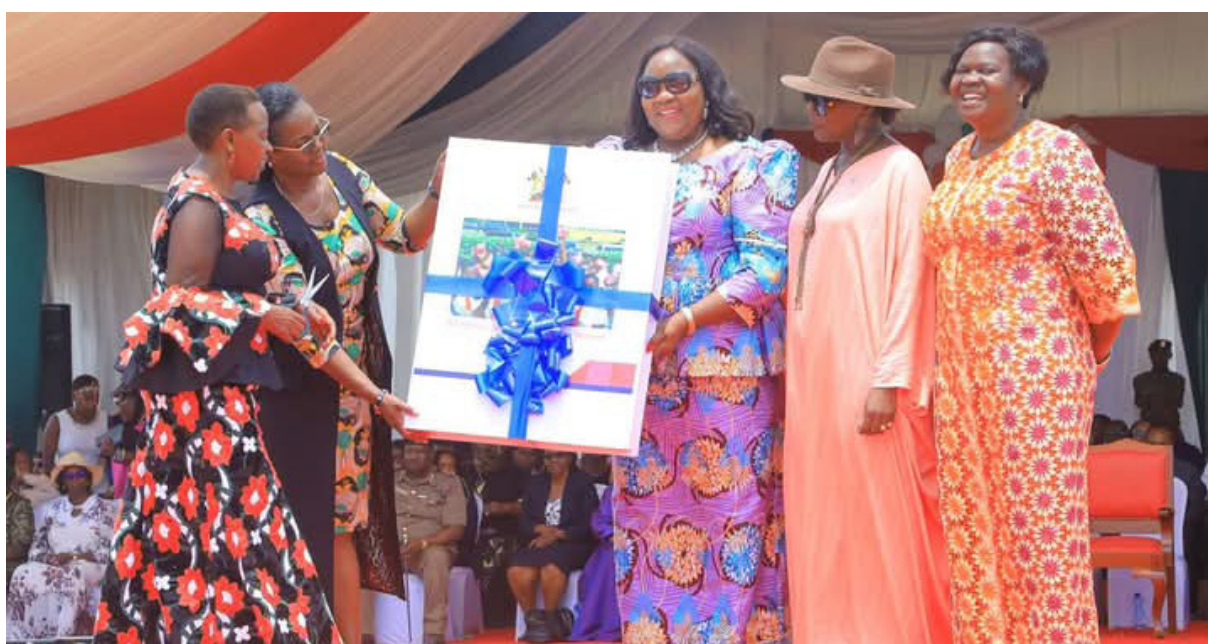
The unveiling of the Beijing+30 Report during the IWD celebrations.

The First Lady also launched the Beijing+30 Kenya Country Report 2025, which highlights Kenya's progress in promoting women's rights, addressing gender-based violence, and enhancing women's economic empowerment.