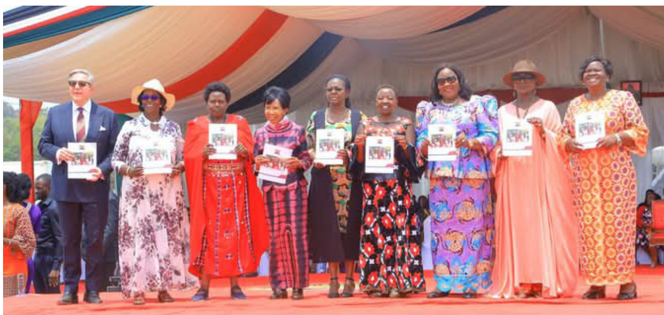
A group photo of the exceptional women celebrated at this year's national celebrations of IWD.