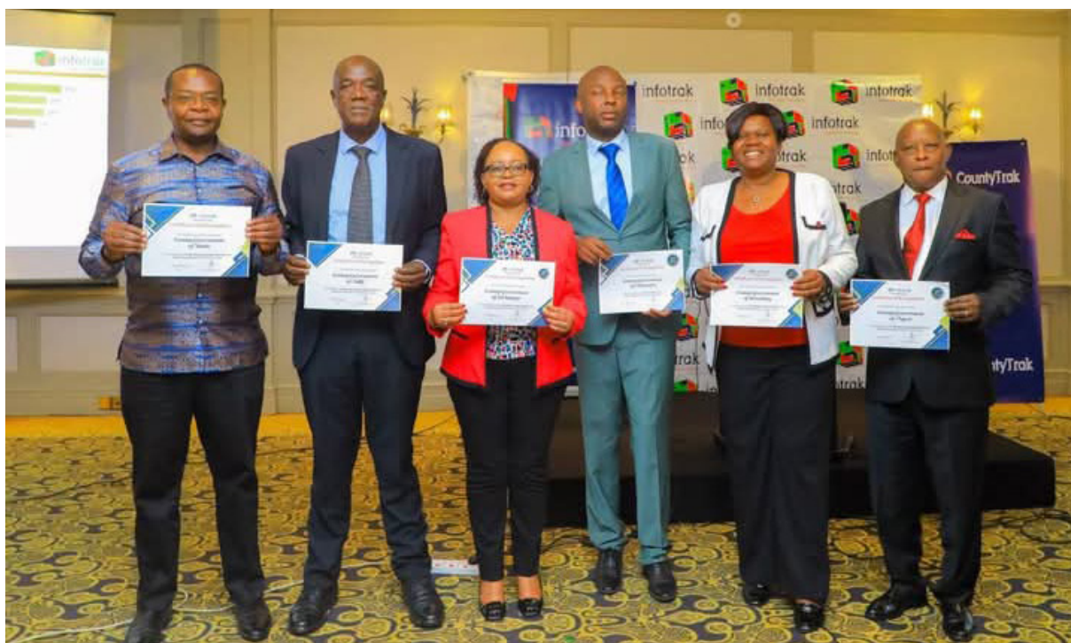
The best performing governors.

Governor Wanga’s commitment to transparency, efficiency, and partnerships is transforming the county, and the latest poll results reflect a vote of confidence in her people-centric and ward-based programs, which have positively impacted households across the county.