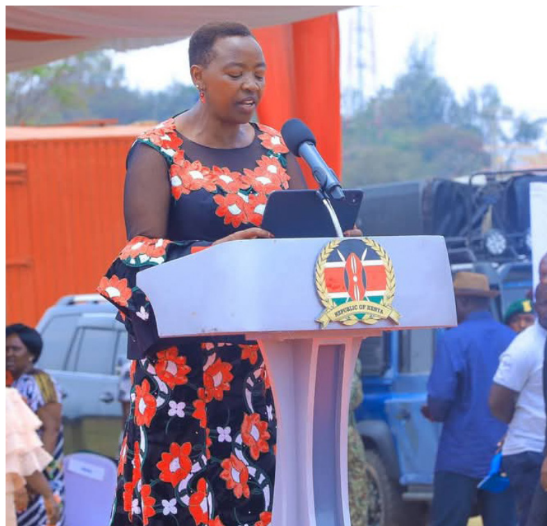
The First Lady Mama Rachel Ruto giving her keynote address at the event.