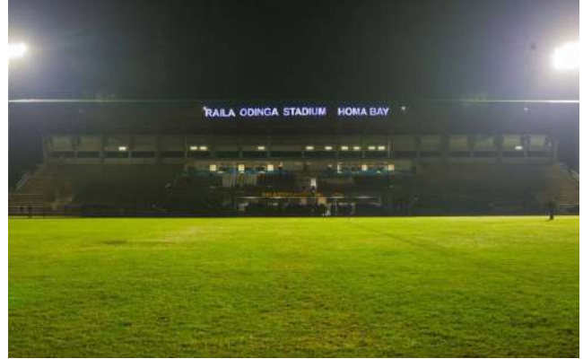
The glitter of the stadium in the night floodlights

A fully packed stadium, almost twice the official capacity of 20,000, cheered on as the country's most recognizable defender of democracy, flanked by his protégé Governor Gladys Wanga, made a memorable lap of honor around the new stadium, ushering in a new wave of optimism among the locals and stamping on the county government is putting up a joint EAC bid to host the 2027