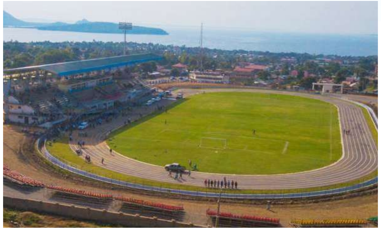
An aerial view of the new Raila Odinga Stadium, Homa Bay with the lakefront in the background

Homa Bay County Got a New World-Class Stadium