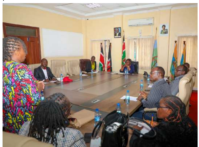
The boardroom meeting where a deal to work together on disaster response and mitigation was sealed

Regarding health emergencies, the county government and the Society will embark on training and equipping the community health workers on first aid, disease detection on the first account, data capturing and remittance, and health awareness so they are ready for whatever eventualities in their localities. The two institutions will also work closely on water and sanitation, common diseases vaccinations, and child malnutrition as well as revamping the campaign to have more residents register for the National Health Insurance Fund plan.