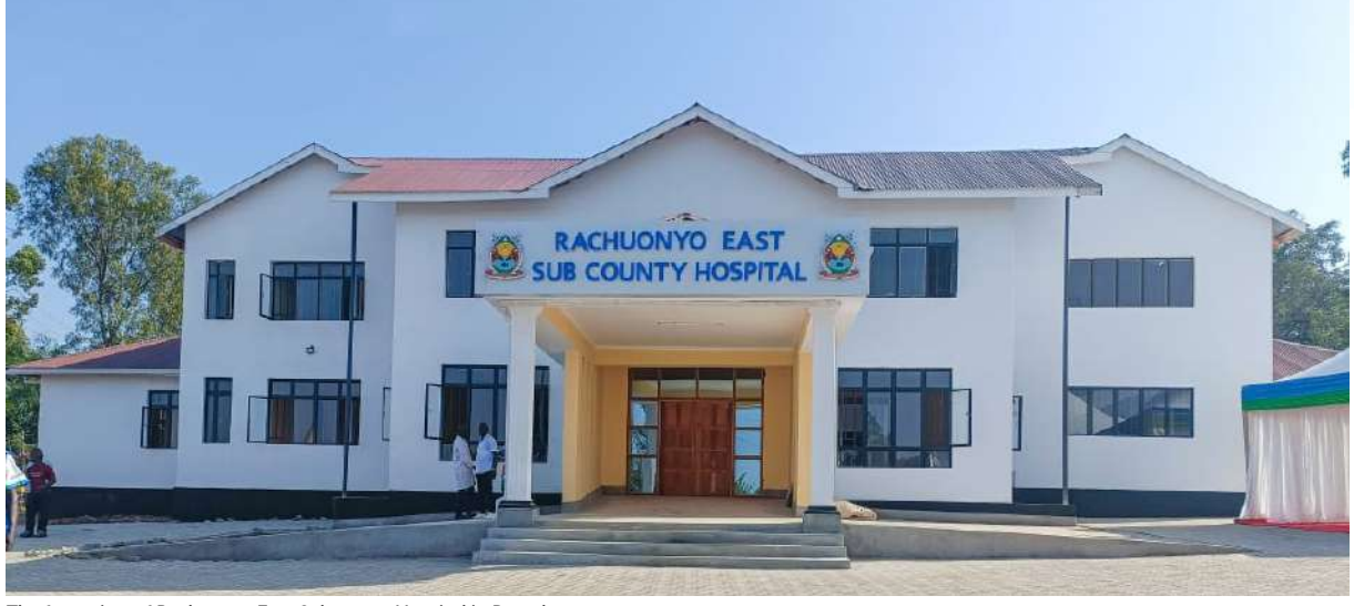
The front view of Rachuonyo East Subcounty Hospital in Ramula