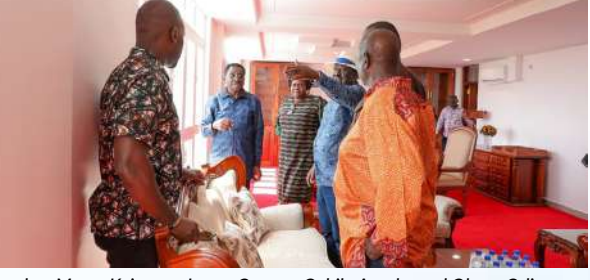
Leaders Moses Kajwang, James Orengo, Ochilo Ayacko and Oburu Odinga join Governor Wanga and Raila Odinga in admiring the ambience of the new office