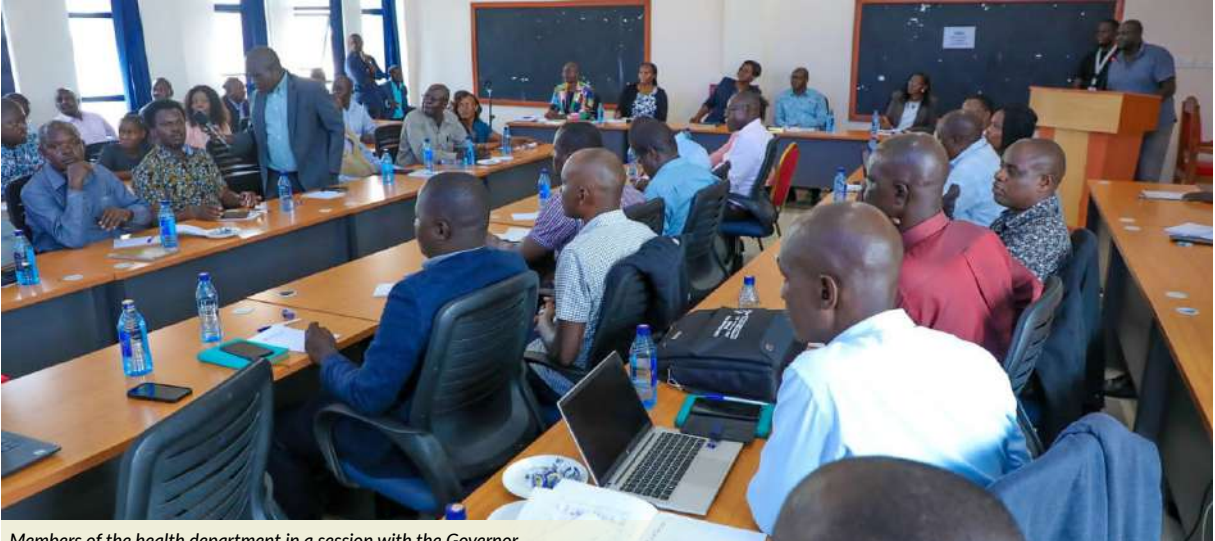
Members of the health department in a session with the Governor

odern governance, administration, and service delivery is a business that strives for efficiency to keep pace with the competition. For all of the technical proficiency and automation that we have come to rely on, it is still people who run the government, making it all the more important to get the best effort from your employees, and increasing their productivity must top the list of the employer's priority.