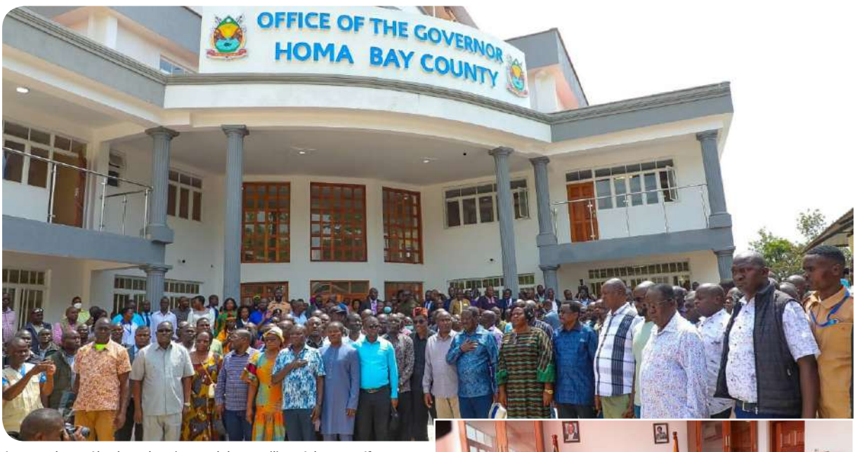
A group photo of leaders who witnessed the unveiling of the new offices

The new Homa Bay County Governor's office block is finally opened in pomp and color at a ceremony presided over by former premier Rt. Hon Raila Odinga.