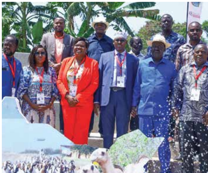
Rt. Hon Raila Odinga, flanked by the CoG pose for a photo at the Arboretum Amphitheater