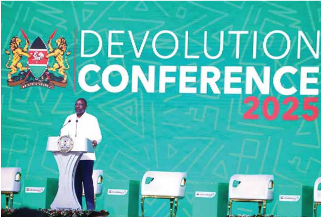
President William Ruto giving his keynote address on the opening day of Devolution Conference 2025 at Homa Bay High School

President William Ruto officially opened the 9th Devolution Conference at Homa Bay High School, setting an ambitious tone for the gathering by urging delegates to contribute actively to the nation's progress. This conference emerged as a vital platform for national dialogue, reflecting the importance of participatory governance in Kenya.