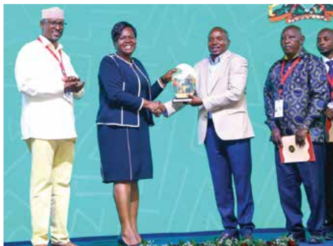
Deputy President Prof. Kithure Kindiki receives a gift from host Governor Wanga