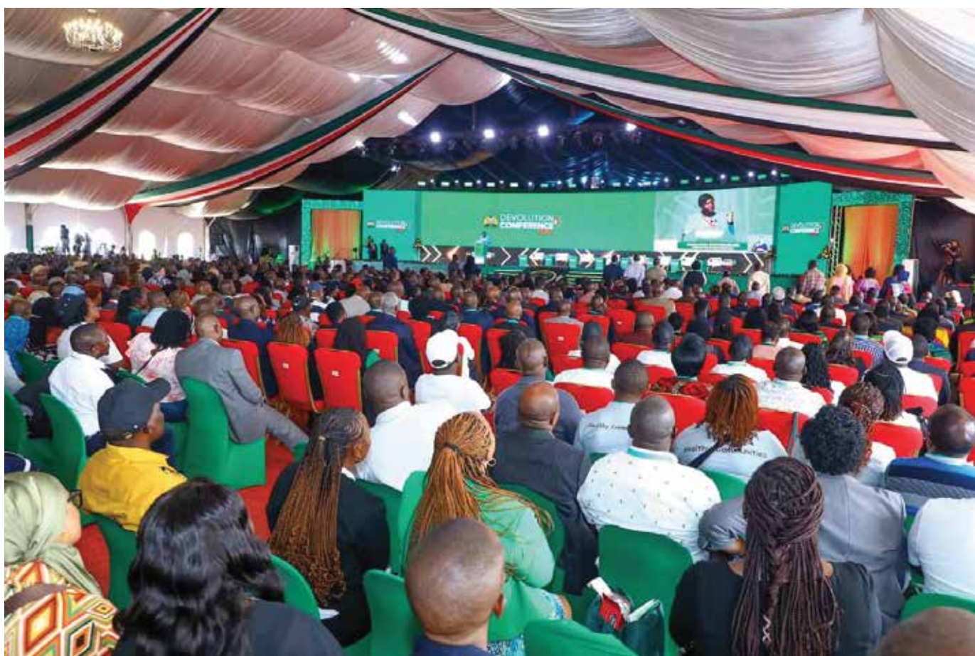
Delegates at the conference