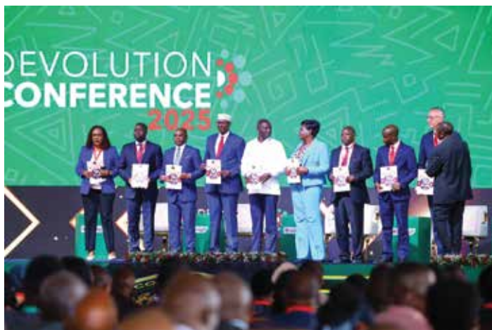
Leaders display the newly launched Devolution Training Handbook.

The Devolution Conference 2025, notable for being the second to be held in the Nyanza region and the inaugural one in Southern Nyanza, not only celebrated the significant strides made by the county in the realm of devolution but also highlighted the remarkable achievements under the leadership of the region's first female county boss, Governor Gladys Wanga. This gathering served as a powerful catalyst, reigniting the county's collective determination to expand possibilities, dismantle barriers, and forge a future that uplifts every citizen, no matter their background.